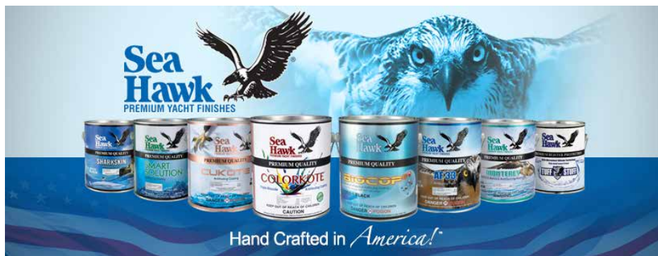
Facebook Cover Image

Sea Hawk Paints has a respective reach on Facebook with 12,741 followers. There is a strong degree of branding with our Cover Image echoing many of our visual branding elements, such as our logo, product photos and our premium tagline “Hand Crafted in America!”